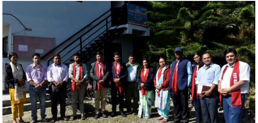
Group photo after monitoring the EEC office by CDO of Kavre, ward chairman and NGO federation Nepal