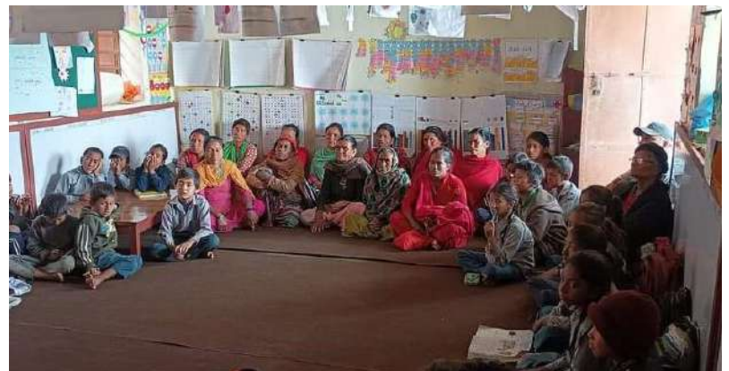
Conducting Mother Group meeting by school