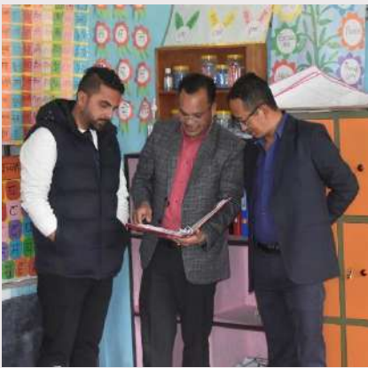
Sharing the student's portfolio to Joint monitoring team