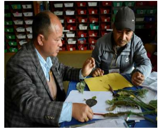
Practicing the collage in the pair during teacher training