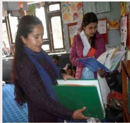
Observing the student's portfolio during joint monitoring