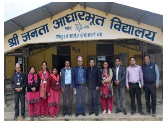
Group photo after monitoring the school