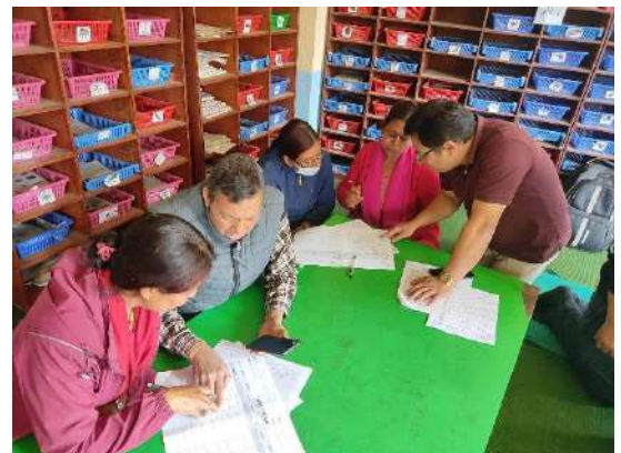
Preparing Annual action plan – during CIP workshop