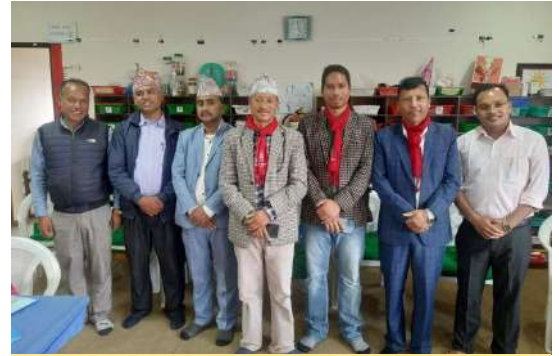
Observation of the training hall by Tribeni Rural Municipality Rolpa