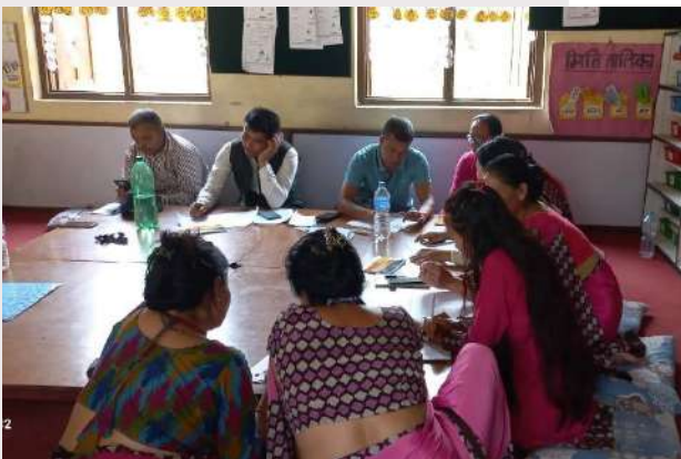
Cluster workshop of Teachers