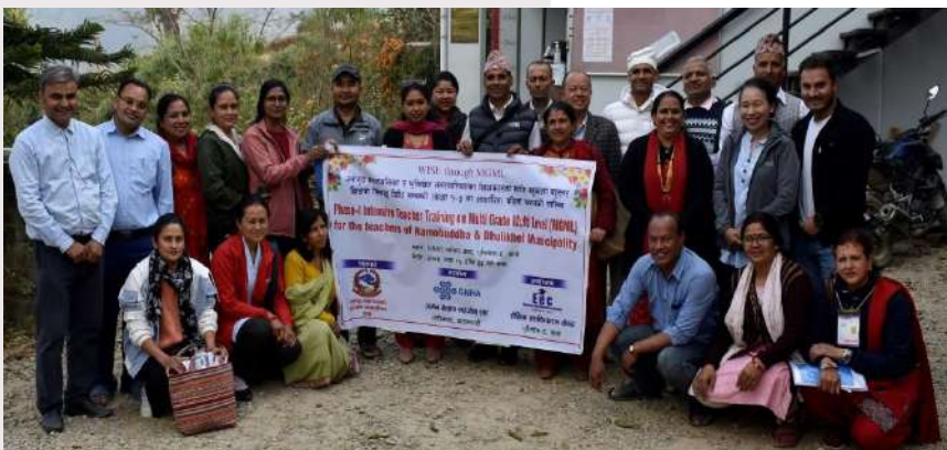
Group photo of Teacher training (Phase-1, Dhulikhel & Namobuddha)