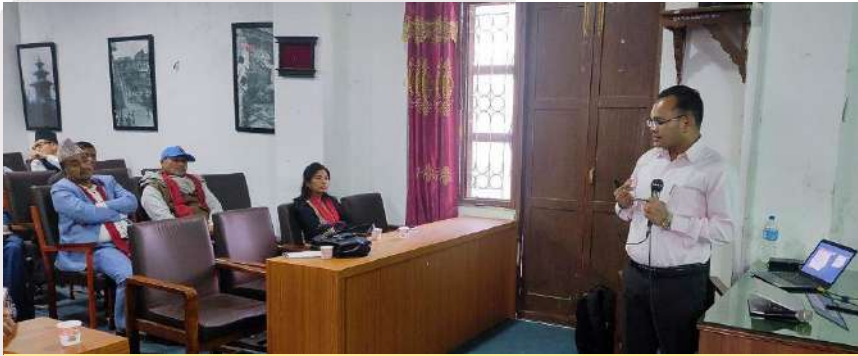
Briefing about the WISE program to Tribeni Rural Municipality Rolpa at Dhulikhel Municipality Hall