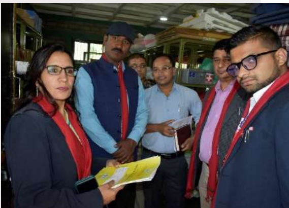
EEC being monitored by CDO of Kavre, ward chairman and NGO federation Nepal