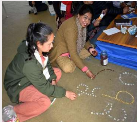
Practicing the number writing during teacher training